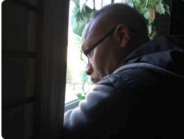
Listening back during recording session