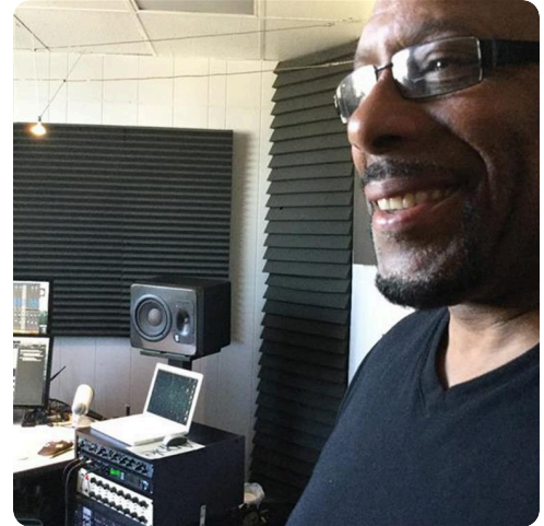
Smiling as usual